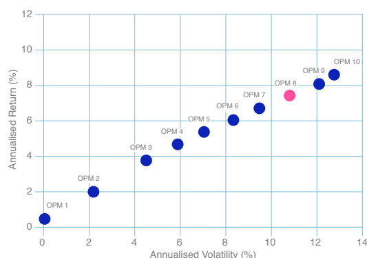
Volatility calculated on a monthly basis.